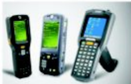
RFID Enabled Scanners