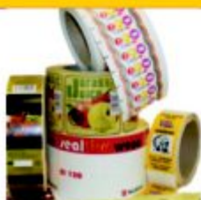
Multicolor Premium Die Cut Label Rolls