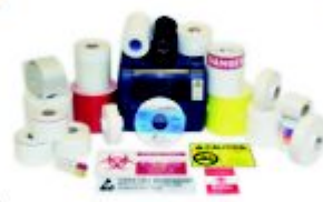
Multicolor Premium Vinyl Rolls