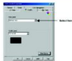
ONYX User Friendly Label Design Software