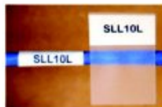
Self Laminating Wire Wraps