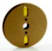
Continuous Flat Heat Shrink Tube Rolls