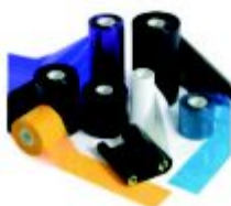
Multicolor Premium Ribbon Rolls