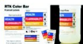
Safety & Sign Labels