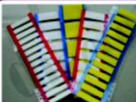
Ladder Type Flat H.S. Tube Rolls